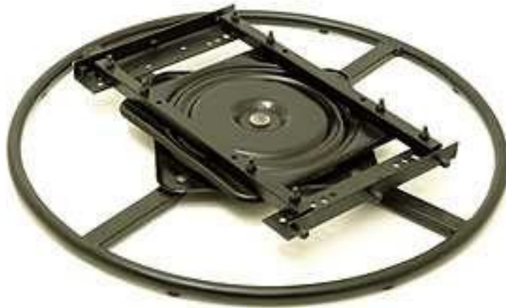
R61 Swivel only

R62AG5102 Swivel, Ring and Adaptor Kit to Fit to 888 Recliner