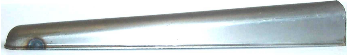
Sintra leg straight side profile

Ph: +649 444 8334 Fx: +649 444 0784 E-mail: sales@caford.co.nz www.caford.co.nz